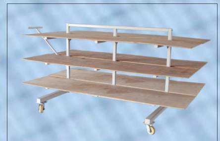
選購件: A2016-2放布板層架 Option: A2016-2 Fabric Support (適用於牛仔布Suitable for Denim)