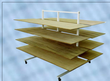
選購件: A2016-1放布板層架 Option: A2016-1 Fabric Support (適用於針織布、梭織布) (Suitable for knitted & woven fabric)